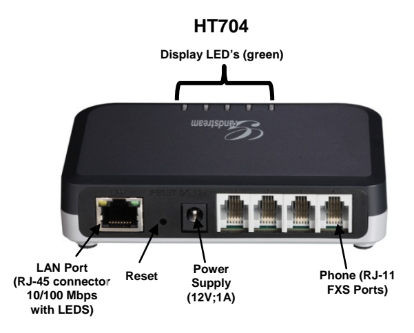
FIGURE 1: DIAGRAM OF HT70X